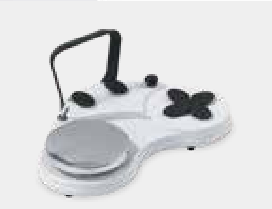
Multifunctional foot pedal: Controlling the lifting of dental chair and the working status of handpiece, etc. Outstanding appearance, sensitive and durable.