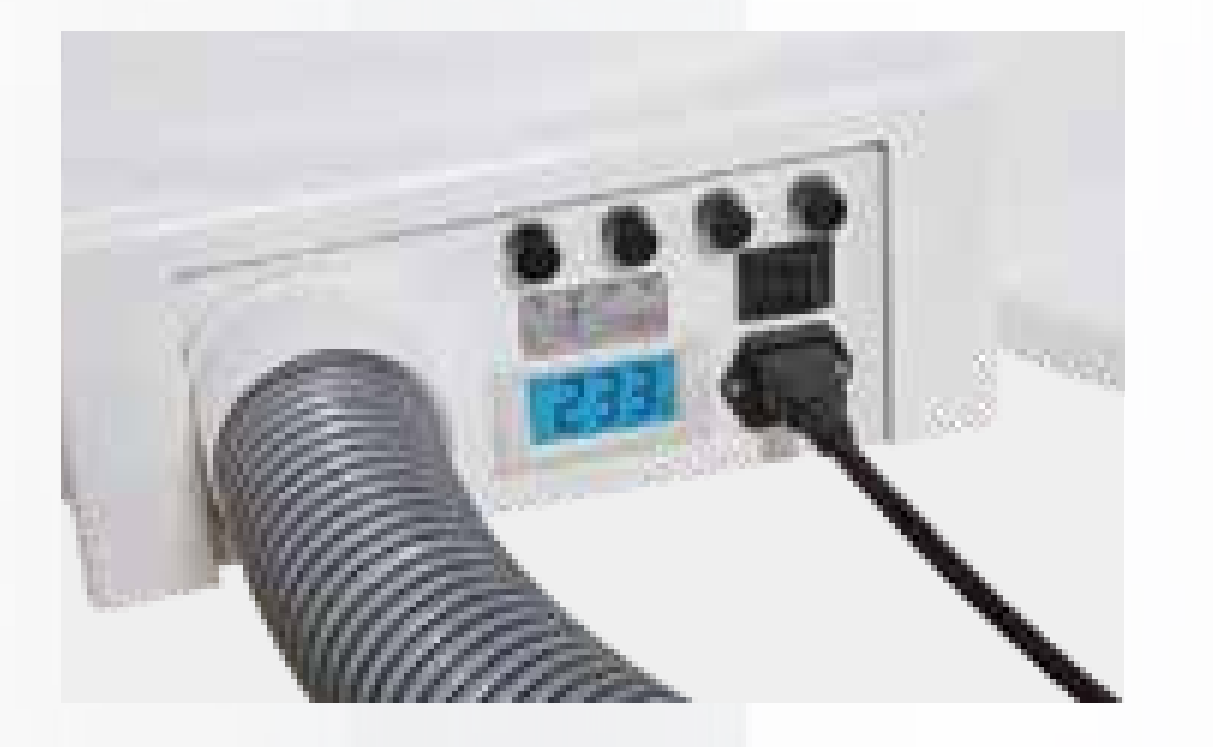
Digital display voltage, with voltage stabilizer

rotated 90 degrees horizontally, more storage space