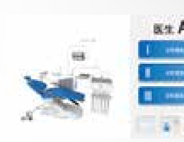
9 sets of chair position memory, providing customized chair position setting.