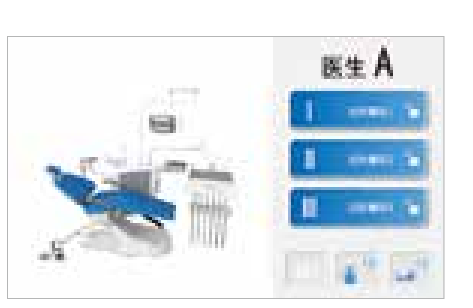
9 sets of chair position memory, providing customized chair position setting