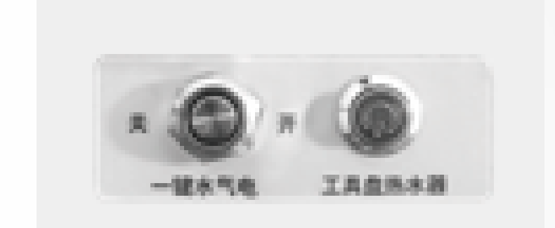
Intelligent electronic control, one-button water and electric switch