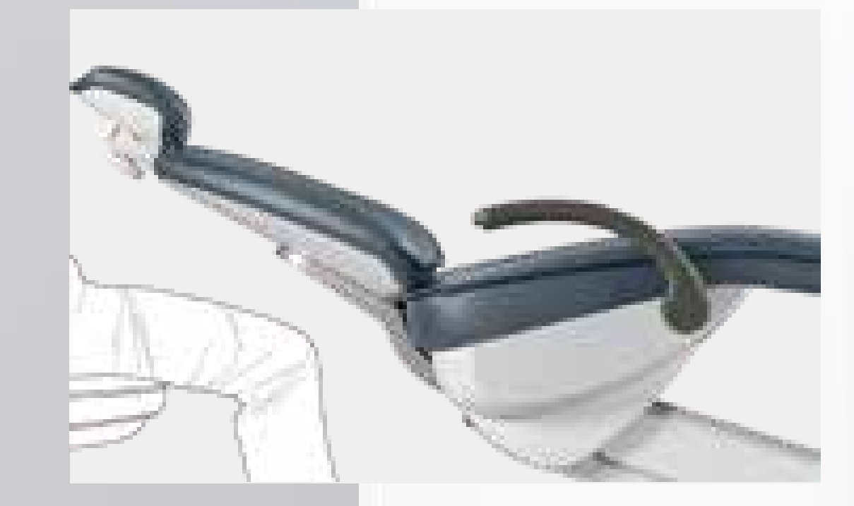
Safety anti-collision function Emergency stop when facing resistance, to avoid the misoperation.

Can provide handpiece and 3-way syringe with warm water. Effectively reduce the soreness during treatment.