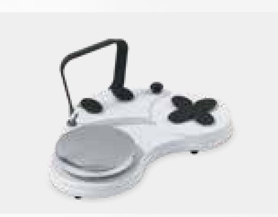
Multifunctional foot pedal: Controlling the lifting of dental chair and the working status of handpiece, etc. Outstanding appearance, sensitive and durable.