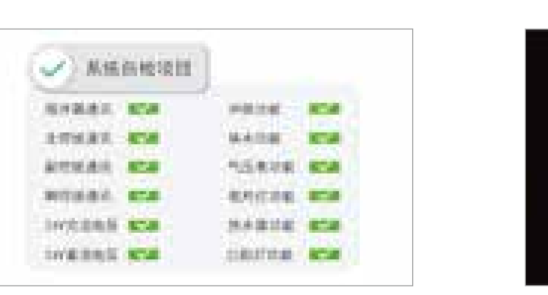
Intelligent self-test when power-on, fault code display

MOS intelligent dental chair control system, to get off work easily