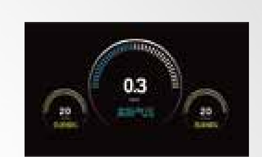
HD LCD screen, With digital air pressure and rotating speed display.