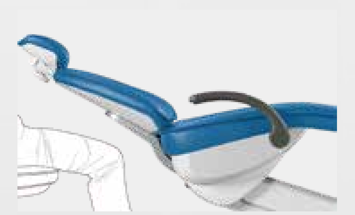
Safety anti-collision function Emergency stop when facing resistance, to avoid the misoperation.