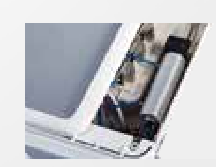
Instrument tray heating water function Can provide handpiece and 3-way syringe with warm water, effectively reduce the soreness during treatment