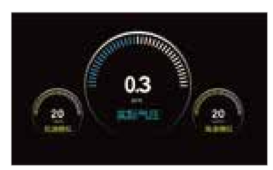
HD LCD screen, With digital air pressure and rotating speed