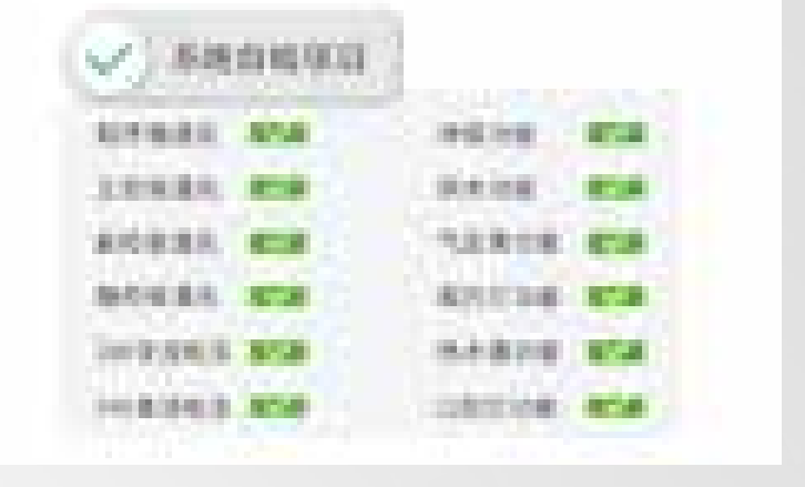
Intelligent self-test when power-on, fault code display.