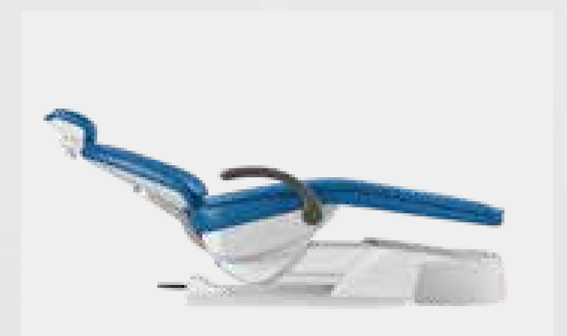
Lowest seat position 380mm ultra-low seat position in industry standard. Convenient for the elderly and children