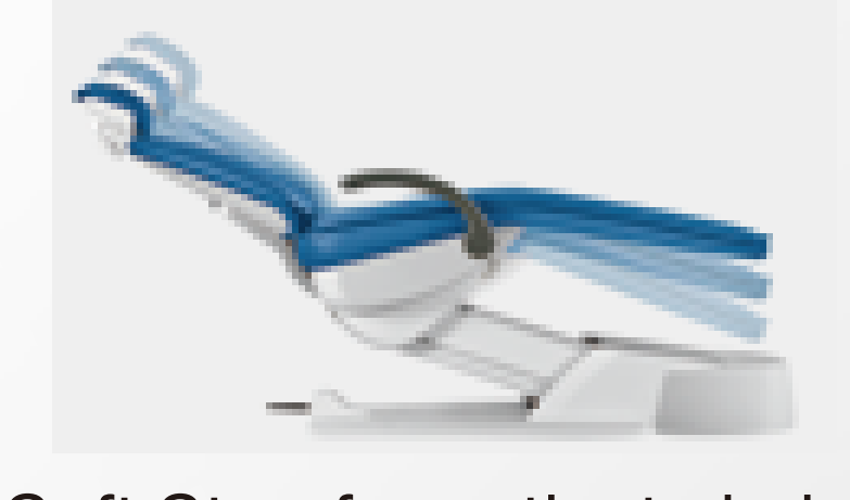
Soft Start and Soft Stop for patient chair Smooth movement for patient chair up and down; more relieved experience for patient.