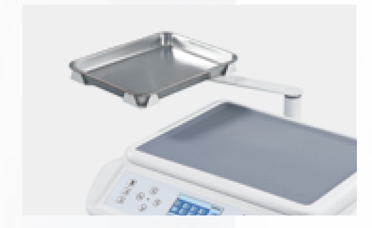
Extended, turnable tray Stainless steel, sterilizable. Can be

rotated 90 degrees horizontally, more storage space