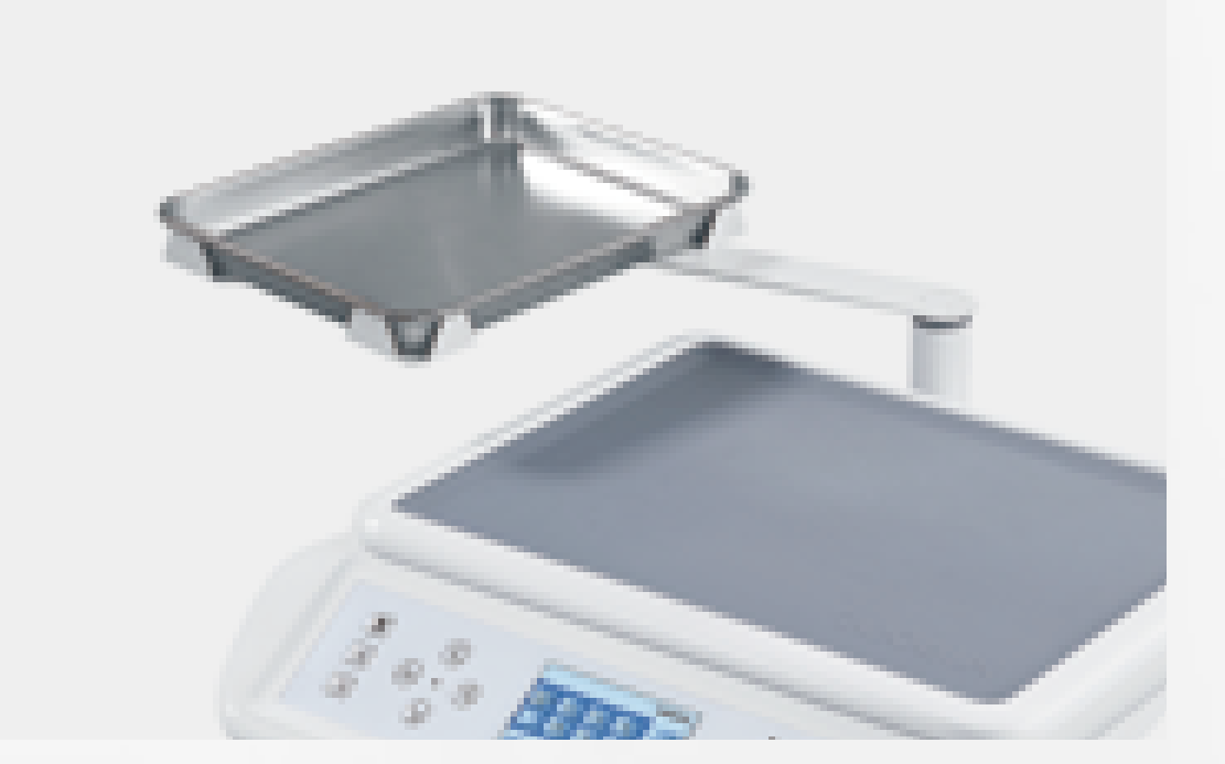
Extended, turnable tray Stainless steel, sterilizable. Can be rotated 90 degrees horizontally, more storage space