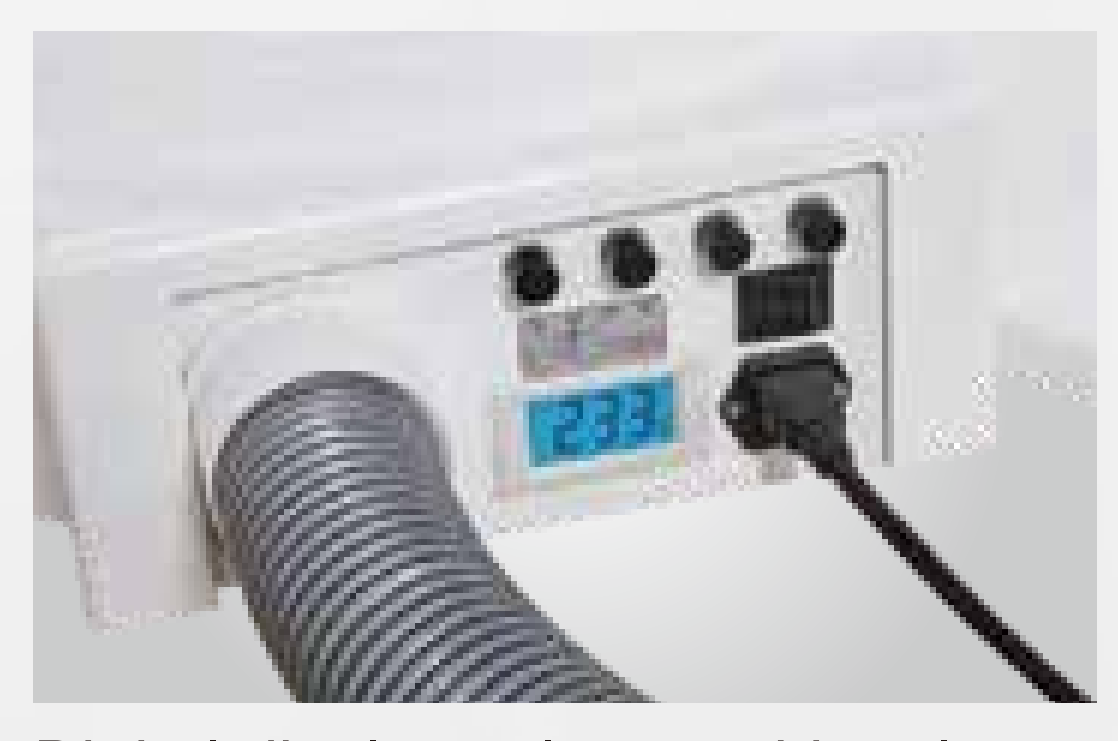
Digital display voltage, with voltage stabilizer Directly display the digits, to protect the dental chair circuit.