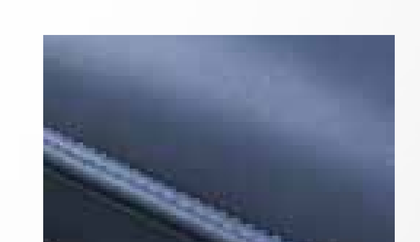
High elasticity microfiber leather Soft and wear-resisting, comfortable when laying down for a long time.